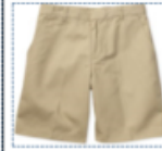
Boy's Shorts in Navy or Khaki