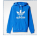
Sweaters, Sweatshirts, and hoodies in Navy, Light Blue, or White. Lettering must be kept to a minimum and only refer to the brand.