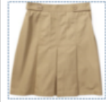
Girl's Skirt in Navy or Khaki