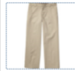
Girl's Pants in Navy or Khaki