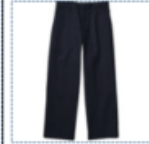
Boy's Pants in Navy or Khaki