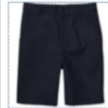
Girl's Shorts in Navy or Khaki