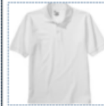
Boy's Short Sleeve Polo Shirt in Navy, Light Blue or White