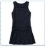
Girl's Jumper in Navy or Khaki