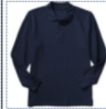
Boy's Long Sleeve Polo Shirt in Navy, Light Blue or White